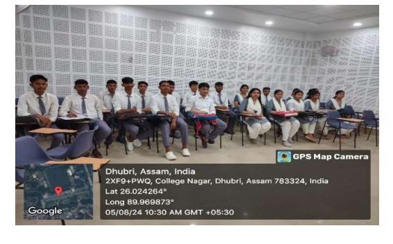
Students of attending the PSO-CO Class